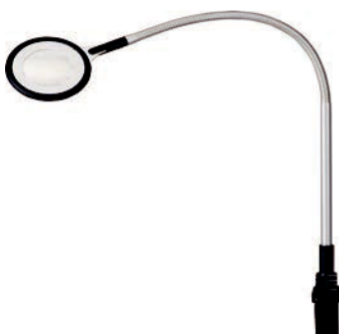
With adjustable clamp