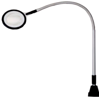
With universal mounting base